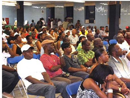
Disappointed Grenadians in the North American Diaspora

Grenadians abroad are deeply committed to nation building and this is why they make the sacrifices of remitting financial and other resources to their loved ones and also taking the opportunity to return home on vacation especially for Christmas and the Carnival seasons.