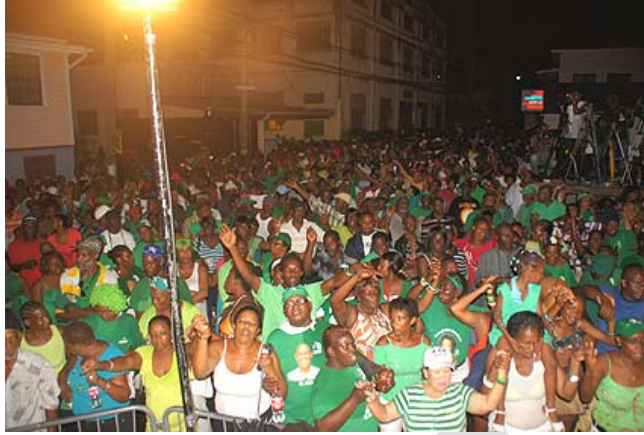
The people of St John came out in large numbers to hear NNP Comrades and their plans for reviving the Grenada economy