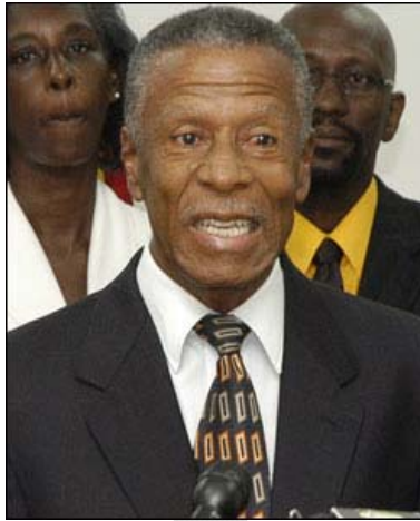
PM Tillman Thomas

It is often said that when a difficult situation presents itself and the fire gets too hot, the only sensible and plausible thing to do is to make a hastily retreat and explain why it was done. The New National Party (NNP) along with many other global observers are fully convinced that Thomas and his disciples should have retreated from political office three months ago as the governance heat has become too hot. However, Thomas in his usual stubborn and eager attitude to hang on to the office of Prime Minister has ignored all calls to take bush. It is indeed a very sad spectre as the crisis within his party deepens,, the economy declines, quality of life for Grenadians becomes more difficult and families are hurting.