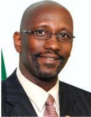
FORMER FOREIGN MINISTER HOOD: RESIGNS?

The persistent rumours over the last month that pervaded the Grenada population regarding the status of Former Foreign Affairs Minister Karl Hood within the Thomas administration has finally come to end. Shortly after his resignation, with tears streaming from his eyes, Hood shared with friends and media representatives, the shoddy treatment that he and his constituents were accorded by Prime Minister Thomas, Finance Minister Burke and Mobilization Minister Noel. He described his four (4) years in the Thomas cabinet as a dictatorial sanctuary that did not entertain and encourage ideas and suggestions for taking the nation forward.